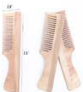
Neem Wood - Handle Comb