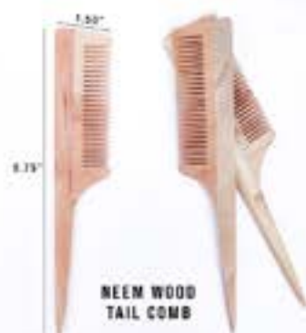
NEEM WOOD TAIL COMB